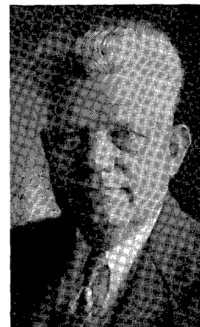
E. A. Gastrock Program